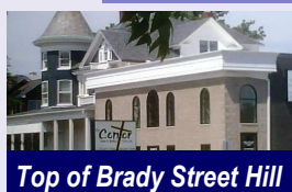
Top of Brady Street Hill