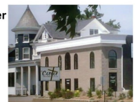
Located inside "The Center" 1411 Brady St. Davenport IA